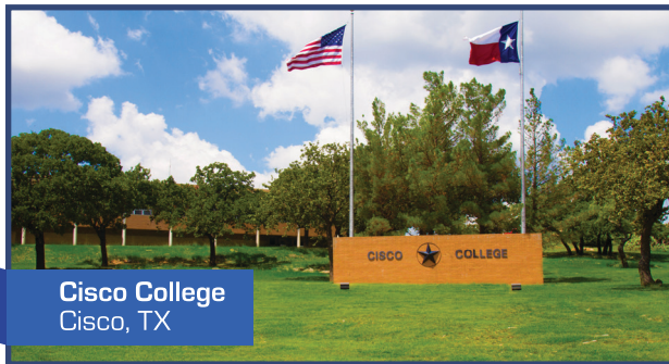
Cisco College Cisco, TX

Dual credit allows high school students to earn college credit and high school credit, concurrently. Cisco College partners with over 40 area high schools to deliver an applicable and quality college education for a fraction of typical college and university tuition costs. Dual credit serves to expand academic options for college-bound students and familiarize them early with college curriculum and expectations. Rigorous and meaningful coursework in high school prepares the student for success in college.